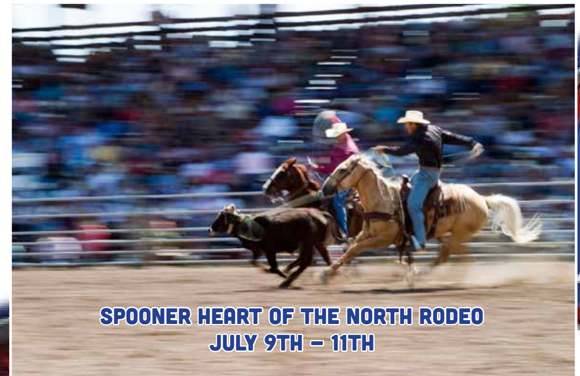
SPOONER HEART OF THE NORTH RODEO JULY 9TH - 11TH