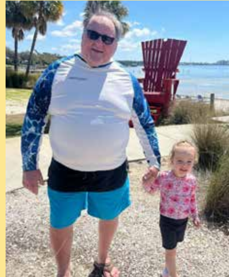
"The future is in our hands"

As the year progresses, we will continue to work hard to keep you up to date on the boat landing and other projects. Our Board of Directors is full but that does not mean we can't back and relax because there is so much more to get done and we have elections in September again.